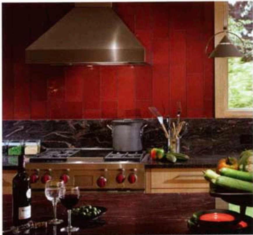
Functionality and design are exemplified in our first place kitchen with this wall hood and Wolf dual fuel range.